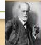
Sigmund Freud Austrian neurologist

THE MIND IS LIKE AN ICEBERG, IT FLOATS WITH ONE-SEVENTH OF ITS BULK ABOVE WATER.